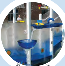
Flow Play No 4