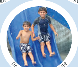
Double Wave Poly Slide