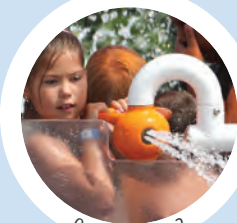
Orb Spray No 2